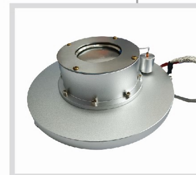
Magnetron Sputtering Head